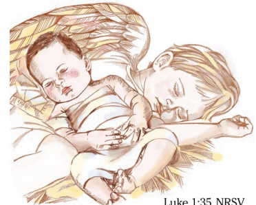
Luke 1:35, NRSV

"The child to be born will be holy; he will be called Son of God."